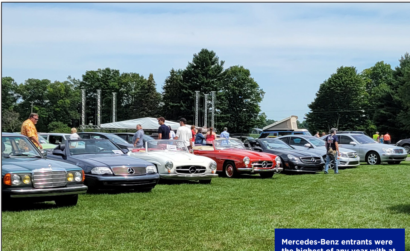
Mercedes-Benz entrants were the highest of any year with at least 60 cars registered.