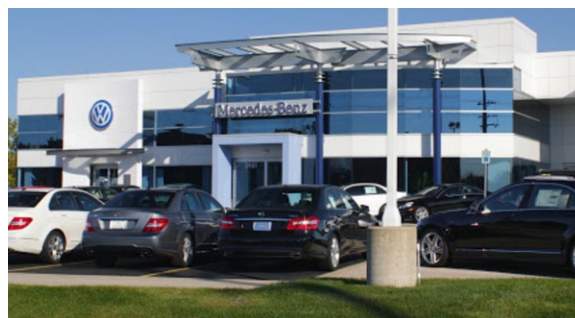
Betten Imports • 866-971-5654 5901 28th Street SE, Grand Rapids, MI 49546 www.bettenimports.com

Below is a list of authorized Mercedes-Benz dealers within our section. Show your MBCA membership card at the Parts Department to learn more about their discount on parts & accessories.