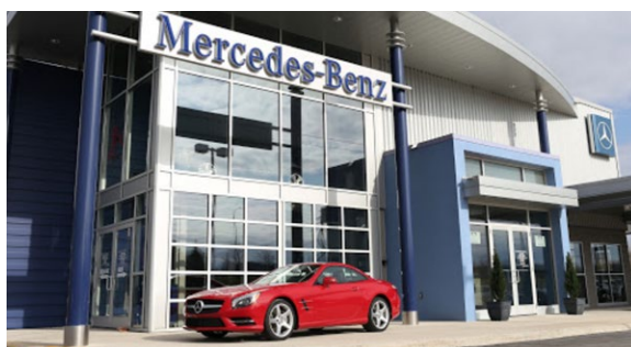
Mercedes-Benz of Traverse City • 231-938-3800 3258 N US Highway 31 S, Traverse City, MI 49684 www.foxmb.com