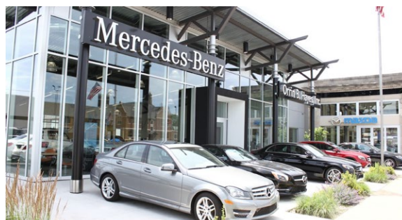
Orrin B. Hayes Mercedes-Benz • 866-414-7803 543 West Michigan Ave, Kalamazoo, MI 49007 www.hayesmb.com